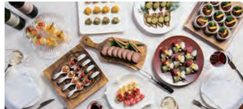
Table Service Japanese, Western, Chinese